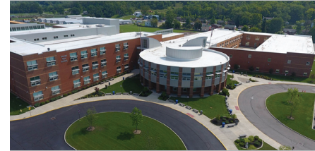
Three Rivers at a Glance

PK-12 Facility- built in 2013 Three Rivers Elementary - PK-4 Taylor Middle School - 5-8 Taylor High School - 9-12