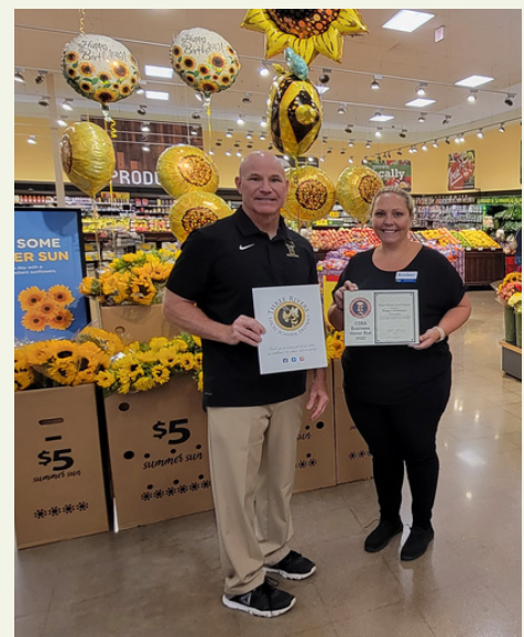
Whitewater Twp Kroger