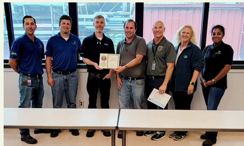
Luminant Miami Fort Station

Combined, the five organizations have made a huge impact on the success of Three Rivers Local School District. From large donations to continuous, ongoing support, all of these businesses have been incredible resources. On behalf of the entire Three Rivers Local School District, we greatly thank all of them.