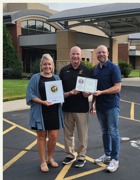
Whitewater Crossing Christian Church