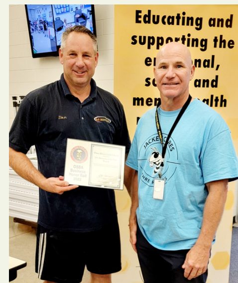
A1 Party Rentals